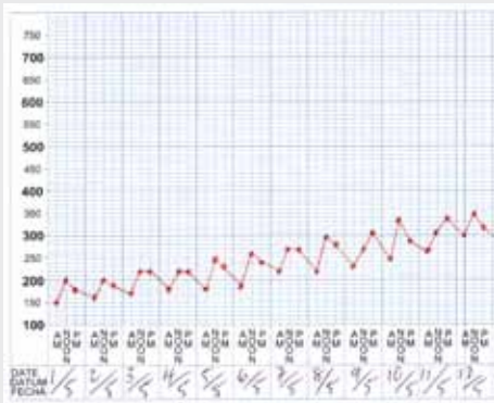
Peak flow record chart showing recovery from acute asthma with pronounced morning dips.